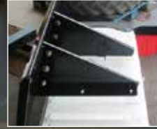
BM Skid steer hitch