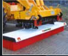
C-Max telehandler quick hitch