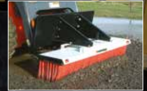
BP skidsteer hitch