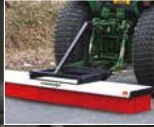
BM 3 point linkage hitch