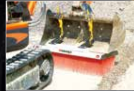
BP bucket hitch