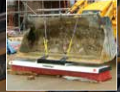
C-Max Bucket guide hitch