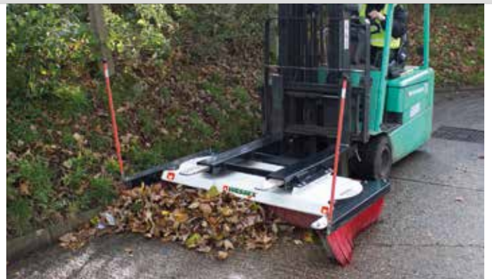
W LANDSCAPE MAINTENANCE