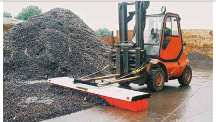
W RECYCLING CENTRES