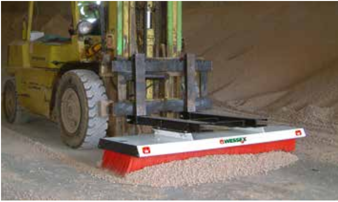
W CONCRETE PLANTS