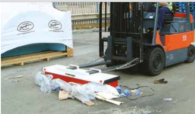
W WAREHOUSE & DISTRIBUTION SITES