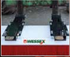
BM fork sleeve hitch