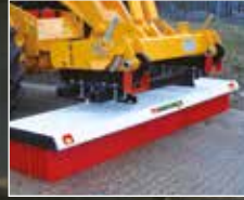
BM telehandler quick hitch