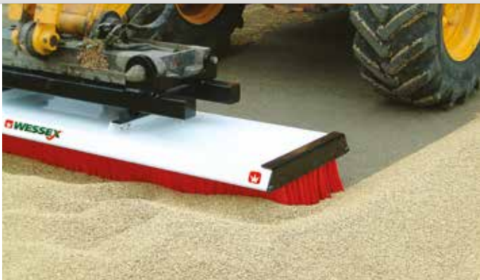
W GRAIN STORES