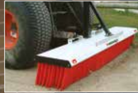
BP 3 point linkage hitch