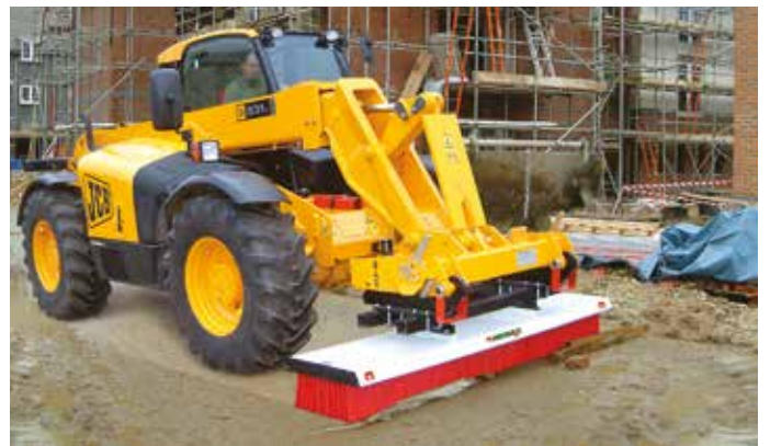
W CONSTRUCTION SITES