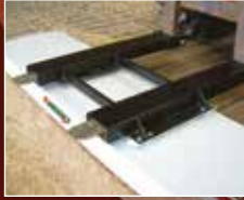
BM fork sleeve hitch for 150mm forks