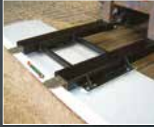
C-Max fork sleeve hitch for 150mm forks