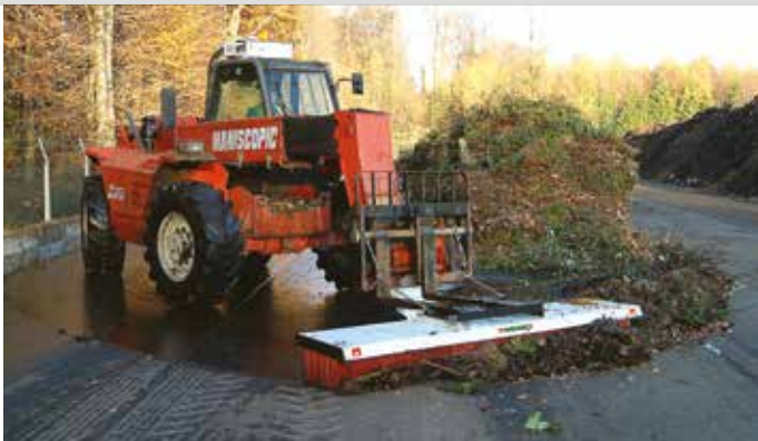
W COMPOSTING FACILITIES