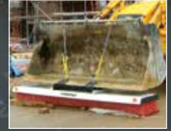
BM Bucket guide hitch